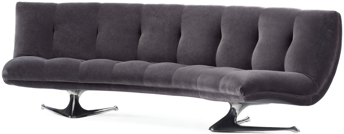
Unicorn Curved Sofa Model - 522 | Designed 1960